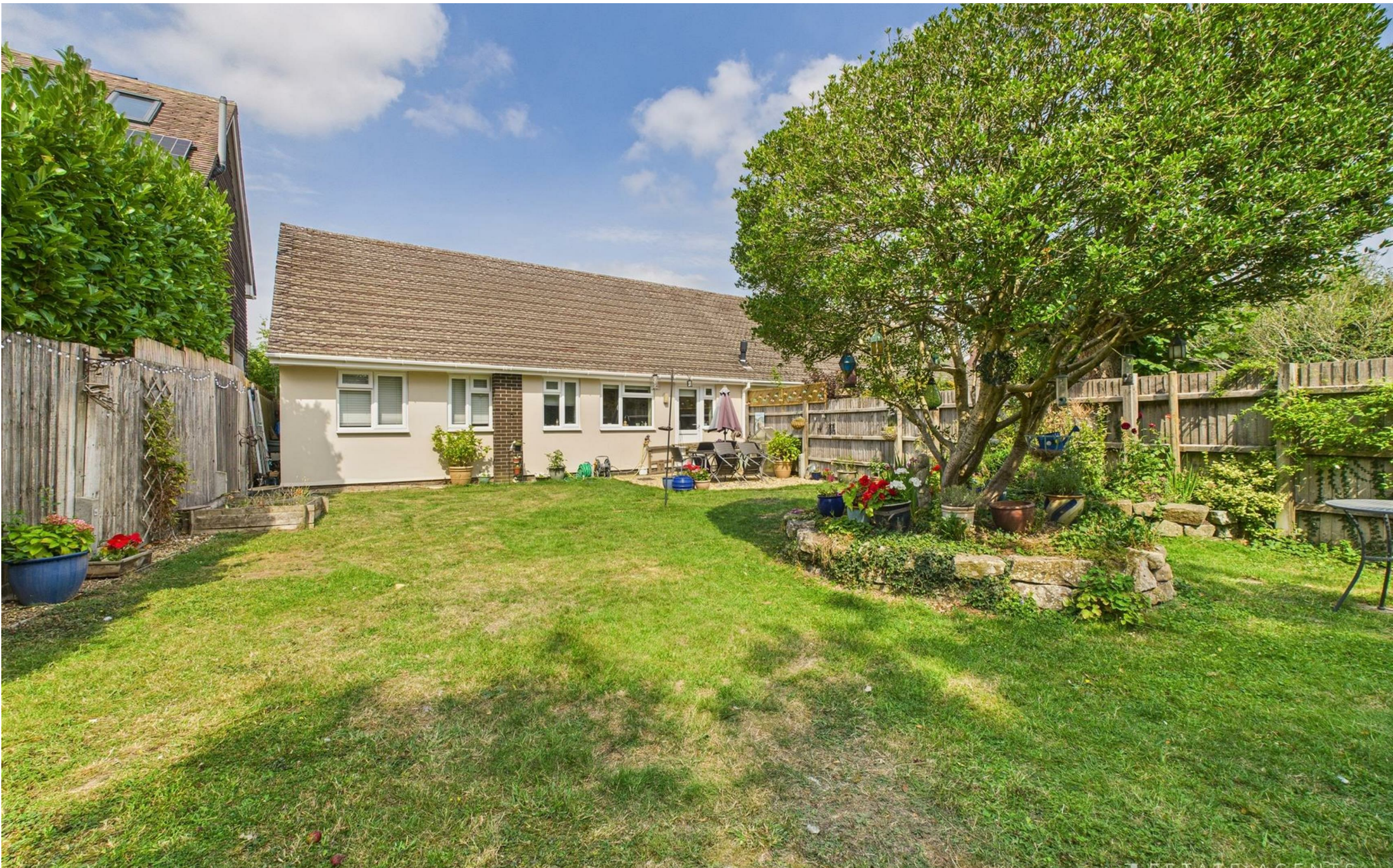
Hackwood Lane, Cliddesden, Basingstoke, RG25 2NH